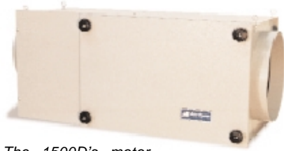
The 1500D's motor blower operates at an extremely quiet 42 dba, yet delivers up to 1500 CFM of air flow.