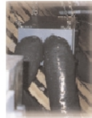
A 1500D concealed above the VFW facility's ceiling.